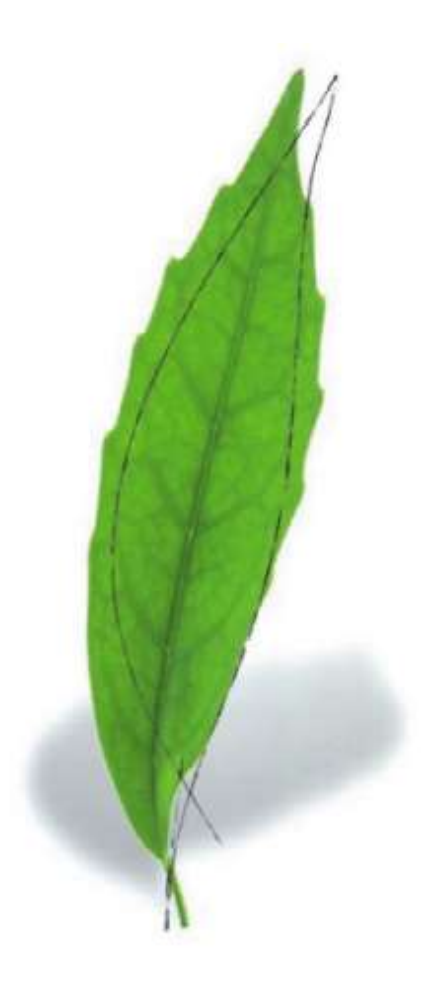
June, 2018 Sharp Corporation